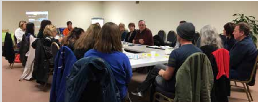
Advocates in Action

Advocates organized public events in their communities that addressed topics such as reducing the stigma associated with addiction, health responses to the addiction epidemic, honoring law enforcement for assisting with overdose reversals, and the importance of recovery support services, in addition to a number of Recovery Month events in September, and Overdose Awareness events in August.