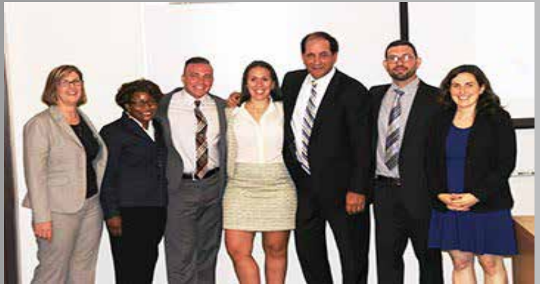
Senator Vitale with staff and advocates from NCADD-NJ and Citizens Action at the SBIRT forum in June

NCADD-NJ has taken on a leadership role as a charter member of the NJ Parity Coalition. Working with allies, it seeks the goal of comprehensively enforcing the federal requirements that mandate health benefits coverage for behavioral health be reimbursed on a par with medical and surgical care.