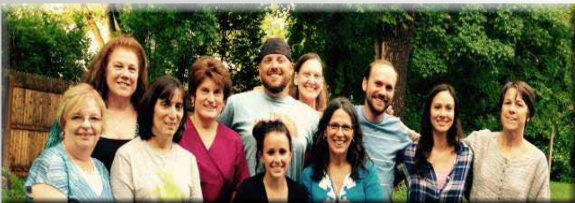
Sussex County Advocates